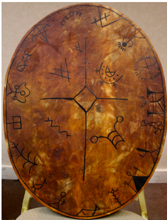
Modern Sami-made drum, indicating a revitalization of shamanism among the Sami.

Step into a world of beauty, unity, and joy. Experience for yourself the power of the compassionate spirits and learn shamanic methods for healing and divination—be part of the reawakening of this amazing work.